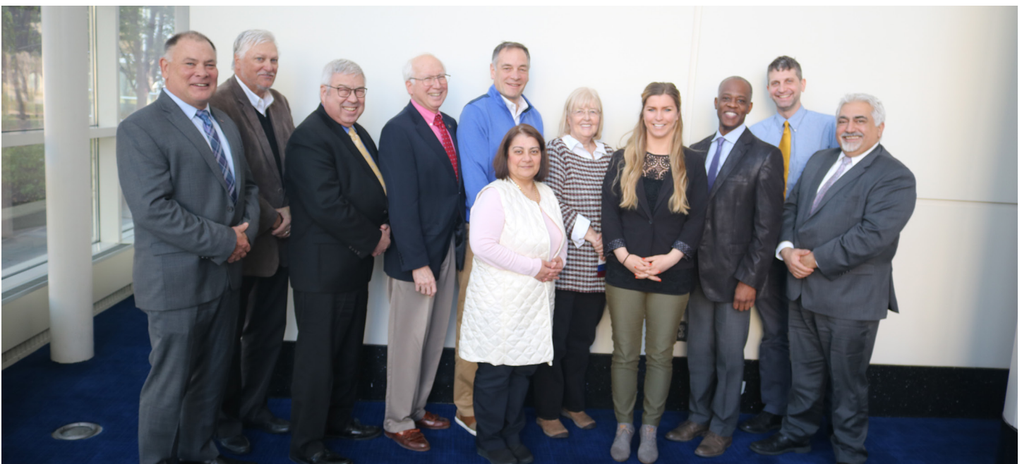
Region 9 Delegates and Alternates