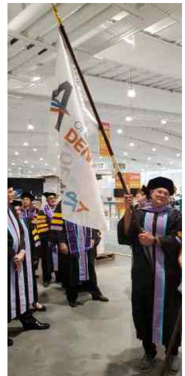
Your Region # 9 Trustee