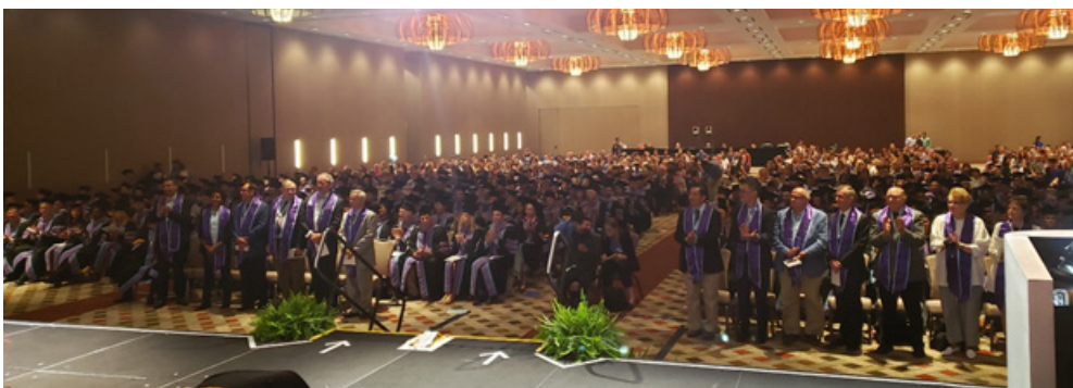
#1 The AGD's Lifelong Learners, Masters and Fellows