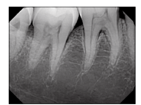
Fig. 2. Radiograph of a hemimandibular phantom taken at 367.7 mR exposure.