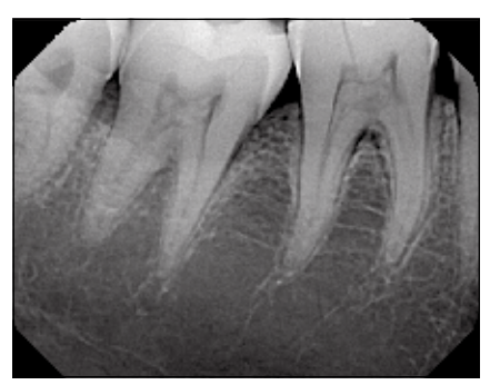
Fig. 3. Radiograph of a hemimandibular phantom taken at 96.7 mR exposure.

NCRP-recommended diagnostic reference levels. One X-ray generator that had passed state certification 1 year earlier had an exposure of 367 mR for bitewing radiographs—twice the maximum recommended exposure of 183 mR.<sup>10</sup> Reducing the exposure time decreased patient exposure radically without affecting the image quality (Fig. 2 and 3). This is an example of the type of situation referred to by Lipoti that led to suggested changes in the New Jersey radiation control program.<sup>13</sup>