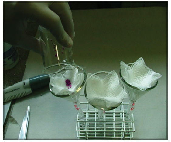
Fig 2. Filtration of the capsule content after mastication.

to assess the masticatory efficiency in children with an anterior open bite by using colorimetric capsules and comparing the results to a control group with normal overbite.