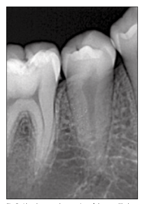
Fig 5. Alveolar crestal resorption of the mandibular right second premolar and first molar 1 week postoperatively. The first molar also exhibits furcation radiolucency, thinning of bony trabeculae, and a widened periodontal ligament space associated with the cervical third of the mesial root on the mesial aspect.

The present case was unique because the lesion was isolated and occurred on the gingiva, which remains a less common site. The mass presented as a painless, pedunculated, exophytic tumor with slow growth. The localization of the tumor on the lingual gingiva of the mandibular right quadrant supported the lingual nerve as origin for the neurofibroma.<sup>4</sup> No associated family history was reported. A thorough examination of the patient for the various manifestations of NF1 (such as café-au-lait spots, Lisch nodules, and axillary freckling) was performed.<sup>20</sup> The