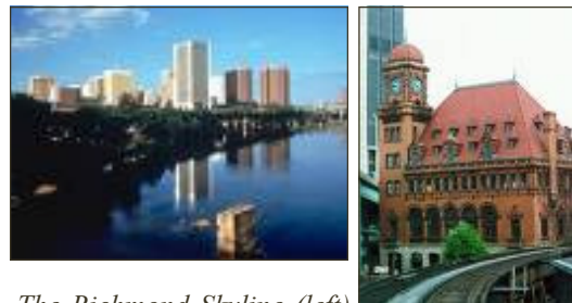
The Richmond Skyline (left) and Main Street Station (right) are chock full of exciting history and fun for you and your family while you spend a weekend of CE, shopping, touring, dining and more.